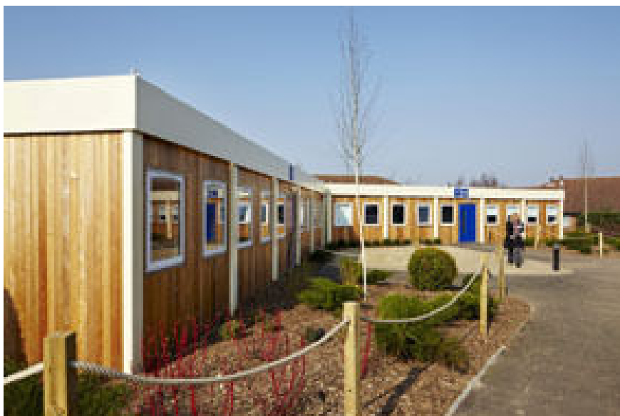
Example of a cedar clad mobile classroom, similar to what is proposed