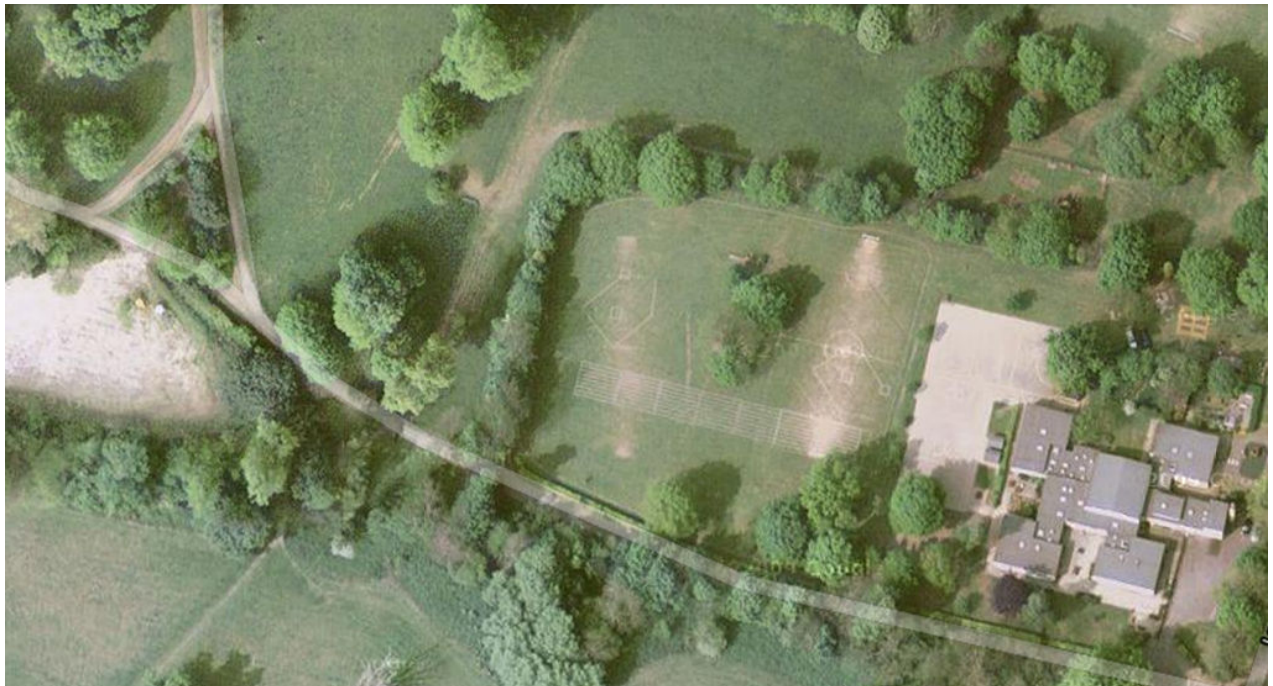
Aerial photograph of the School site