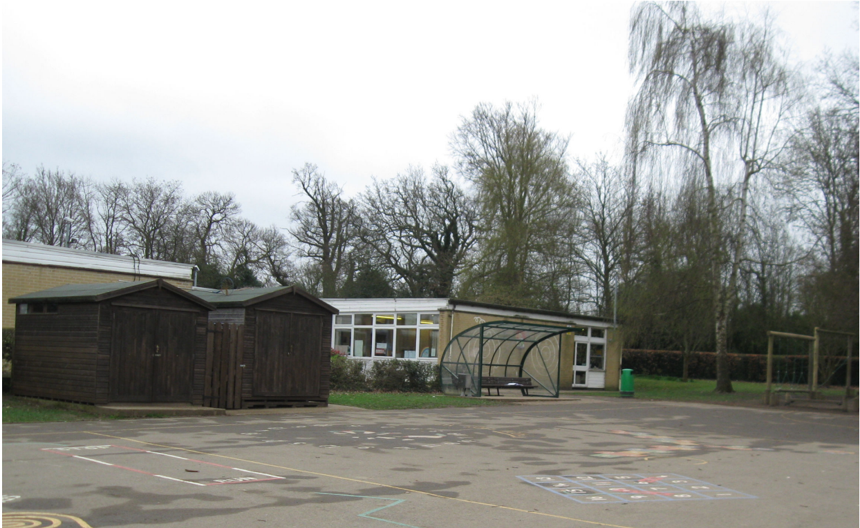
Photograph of the site showing the two sheds to the west and the shelter to be relocated